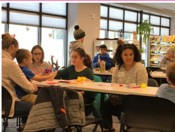
Foster & Adoptive Family Fun BINGO event at the Rice Lake Public Library last Saturday. The kids LOVED the prizes!